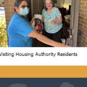
Visiting Housing Authority Residents